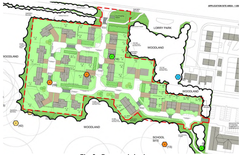
Fig. 3 : Proposed site layout