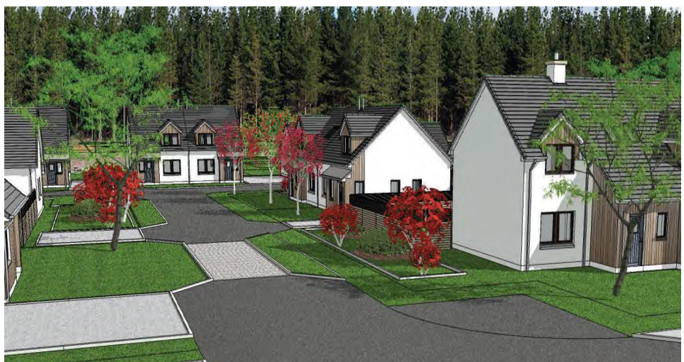
Fig. 3 : 3D image of proposed development

6. The proposed layout reflects the aspirations of the Scottish Government's advice on 'Designing Streets'<sup>2</sup> as well as being designed to reflect the traditional street pattern of Boat of Garten, which includes grids of access roads on north / south and east / west axis. The layout is such that significant emphasis would be placed on non vehicular users, with several pinch points being incorporated into the design in order to slow vehicular traffic and create an increased awareness of pedestrian activity. Black tarmacadam is proposed as the main road surface, with granite setts being used at all pinch points / transition areas. Instead of conventional hard surface footpaths, a more informal approach is also proposed with the use of 2 metre wide grass service strips. In addition to encouraging greater pedestrian activity within the development, the layout also