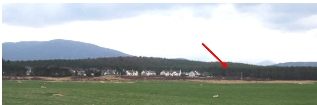
Fig. 2 : Proposed site, adjacent to housing on the western side of the village (as viewed from the A95)